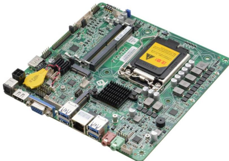
ITX-Y310C VER:1.0 side view