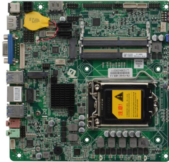
ITX-Y310C VER:1.0 front view